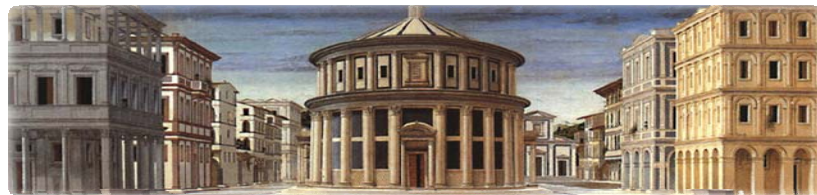
Città Ideale (1475) by Piero della Francesca

AT THE START-UP of this new century we are clear that the empathic circles formed by human beings need to be greatly expanded to include more of us. Everywhere we turn we find that the family which is supposed to be a zone of love and affection is filled with violence and child abuse. How can we consider all others as our brethren if we routinely harm our own family members? Worst of all, in most places, societies condone this behavior as normal. Family violence is not normal and is not acceptable. This failure at non-violent intimate relationships does not bode well for us holding back our aggression towards strangers outside our kinship groups. The fight against cruel degrading human behavior must begin with positive changes in the home!