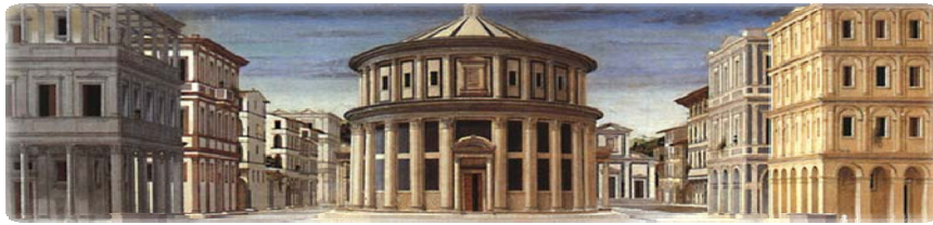
Città Ideale (1475) by Piero della Francesca